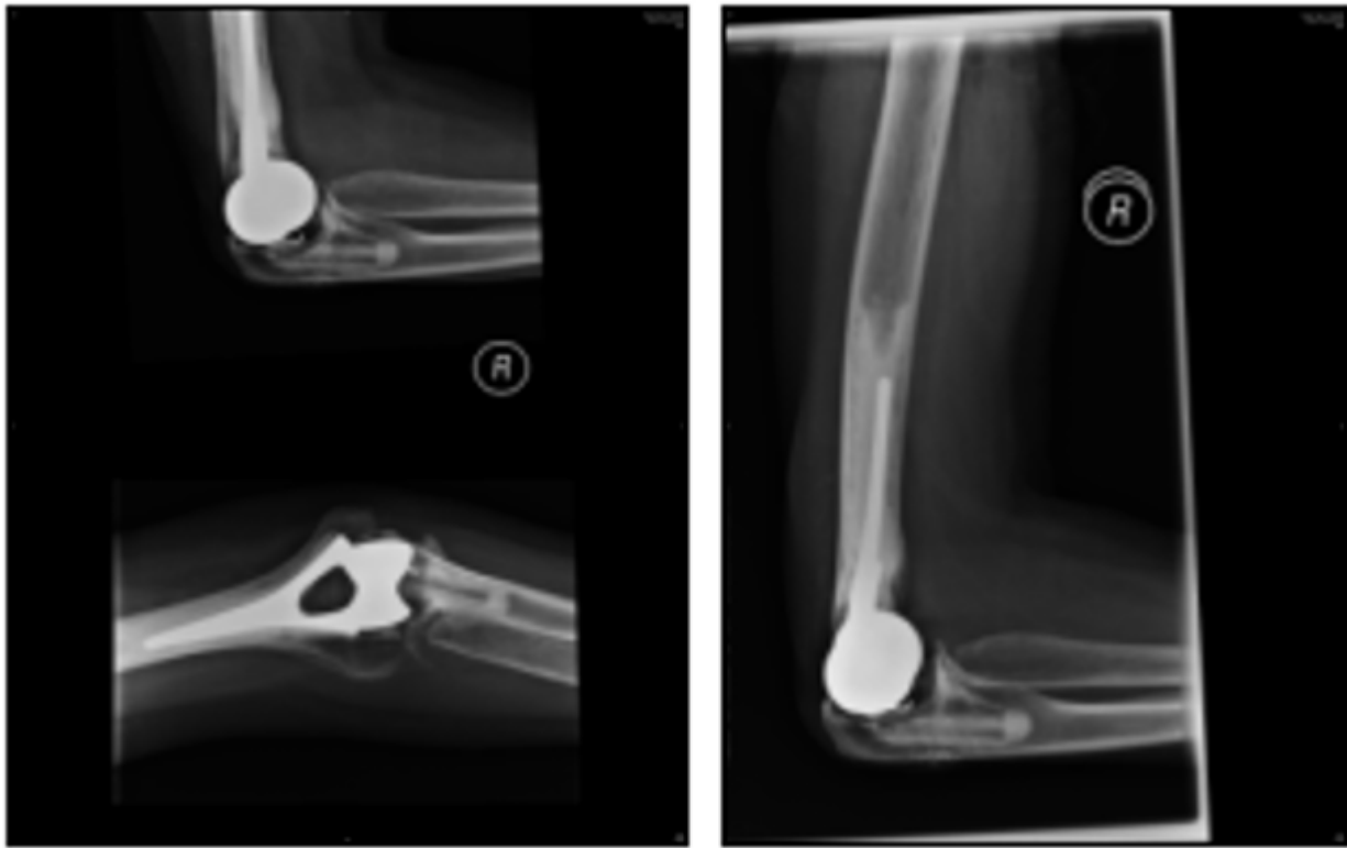
Above: 2009 x-rays (left is side & front view and right is side view of the elbow)