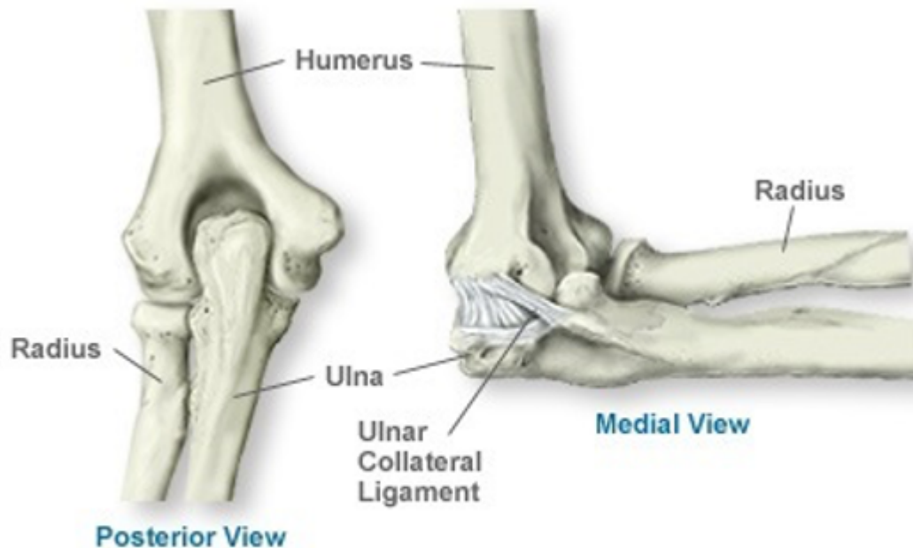
Figure 1: Elbow joint diagram

The risks and benefits of elbow replacement