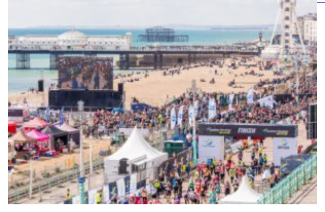
Event, on 06 Apr

Get ready to bounce your way through The World's BIGGEST and most EPIC Inflatable 5k obstacle course. Jump, slide and bounce your way to the finish line like never before. Located throughout the