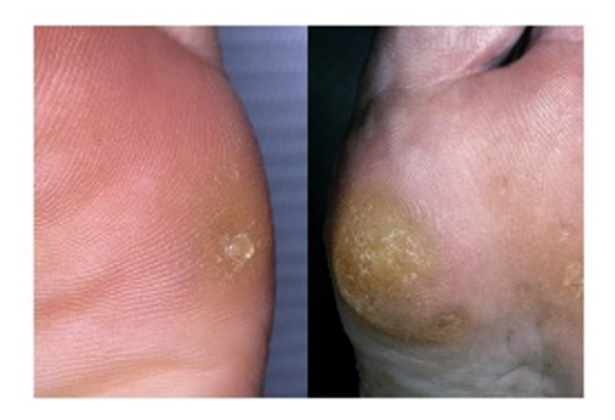
Circulation and nerve problems in the lower limb: