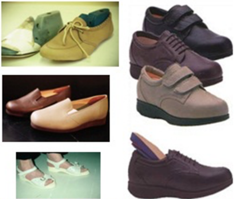
Examples of therapeutic footwear from Reed Medical Footwear catalogue