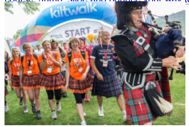
Event, on 01 Jun 2025

Get ready to bounce your way through The World's BIGGEST and most EPIC Inflatable 5k obstacle course. Jump slide and bounce your way to the finish line like never before. Located throughout the